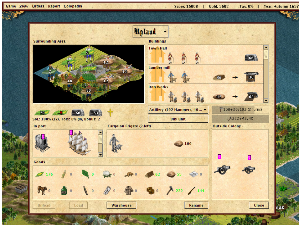
Figure 3.3: The Colony Panel

a different kind of work. If a tile has a red border, then it is being used by another colony or settlement. Please note that you can not use water tiles until you have built docks .