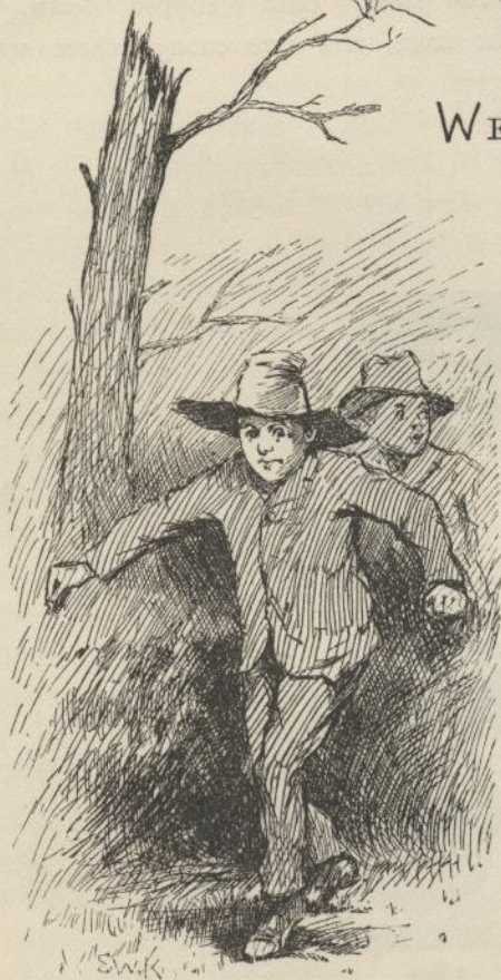
THEY TIP-TOED ALONG.

WE went tip-toeing along a path amongst the trees back towards the end of the widow's garden, stooping down so as the branches wouldn't scrape our heads. When we was passing by the kitchen I fell over a root and made a noise. We scrouched down and laid still. Miss Watson's big nigger, named Jim, was setting in the kitchen door; we could see him pretty clear, because there was a light behind him. He got up and stretched his neck out about a minute, listening. Then he says,